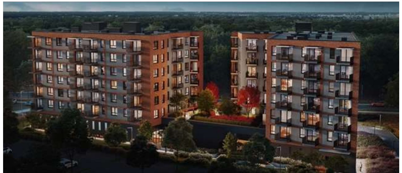
Concept visualisation, Wólczyńska 133, Warsaw, Poland

CeMat is currently negotiating financing of the project with the banks.