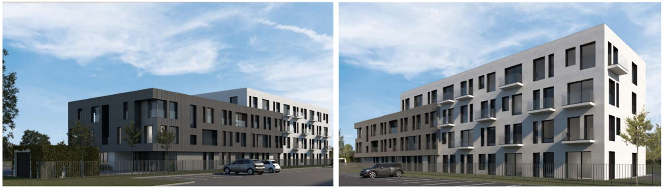
Concept visualisation, Wólczyńska 133, Warsaw, Poland

After obtaining the individual zoning decision, CeMat has started pre-development and design work in order to obtain the building permit. The goal is to get a building permit and start the pre-development work of media connections in 2023.