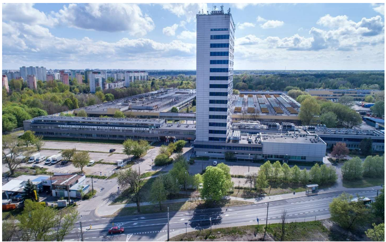
CeMat Complex, Wólczyńska 133, Bielany, Warsaw