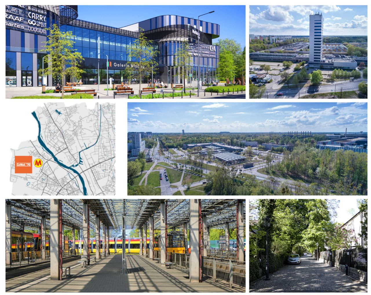
Bielany, Warsaw, Poland

The total area of re-zoned plots is 8,605 sqm (5.4%), out of a total area of 159,300 sqm as at 31 December 2022.