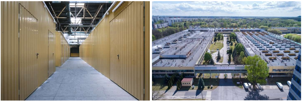
CeMat, Wólczyńska 133, Bielany, Warsaw

The transformation project to SBUs and self-storage entails rearranging selected existing warehouse space. This rearrangement involves demolishing some of the existing partition walls and constructing light structures within the existing buildings. The development work will take place in stages, with 3,700 sqm having been finished to date and an additional 2,100 sqm due to be launched in 2023.